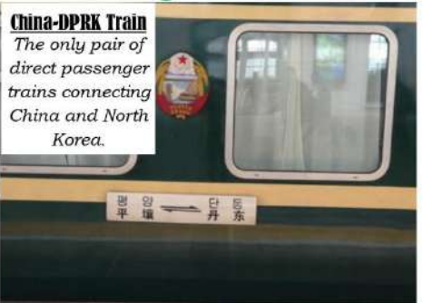
China-DPRK Train The only pair of direct passenger trains connecting China and North Korea.

Gain a different perspective of the country by experiencing its people, touching its landscapes and learning about its rich culture and history. The tour show you the complexity and hidden beauty of this undiscovered country.