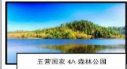
五营国家 4A 森林公园