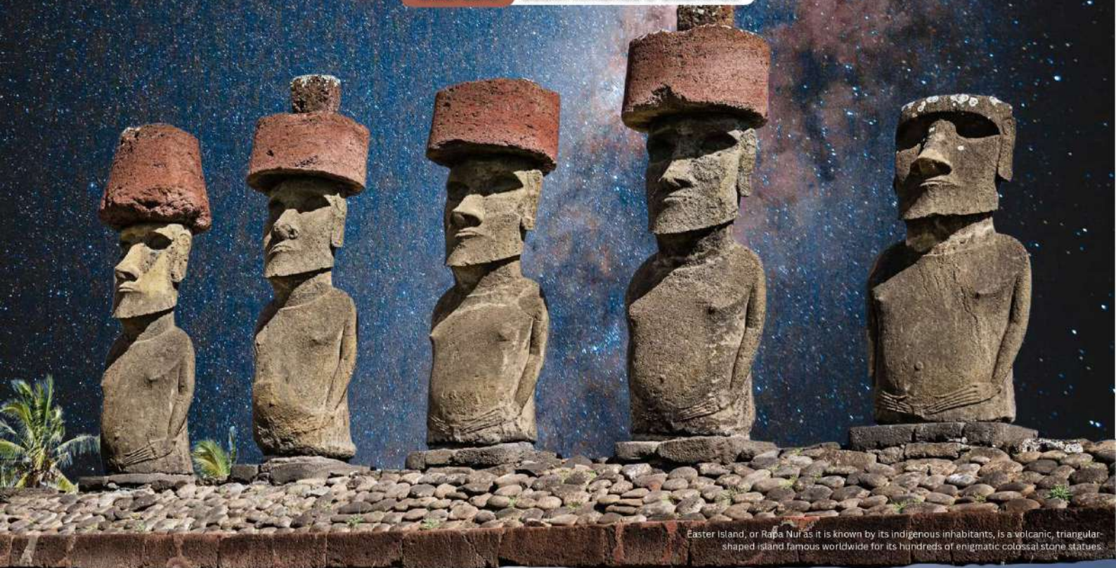
Easter Island, or Rapa Nui as it is known by its indigenous inhabitants, is a volcanic, triangular-shaped island famous worldwide for its hundreds of enigmatic colossal stone statues.