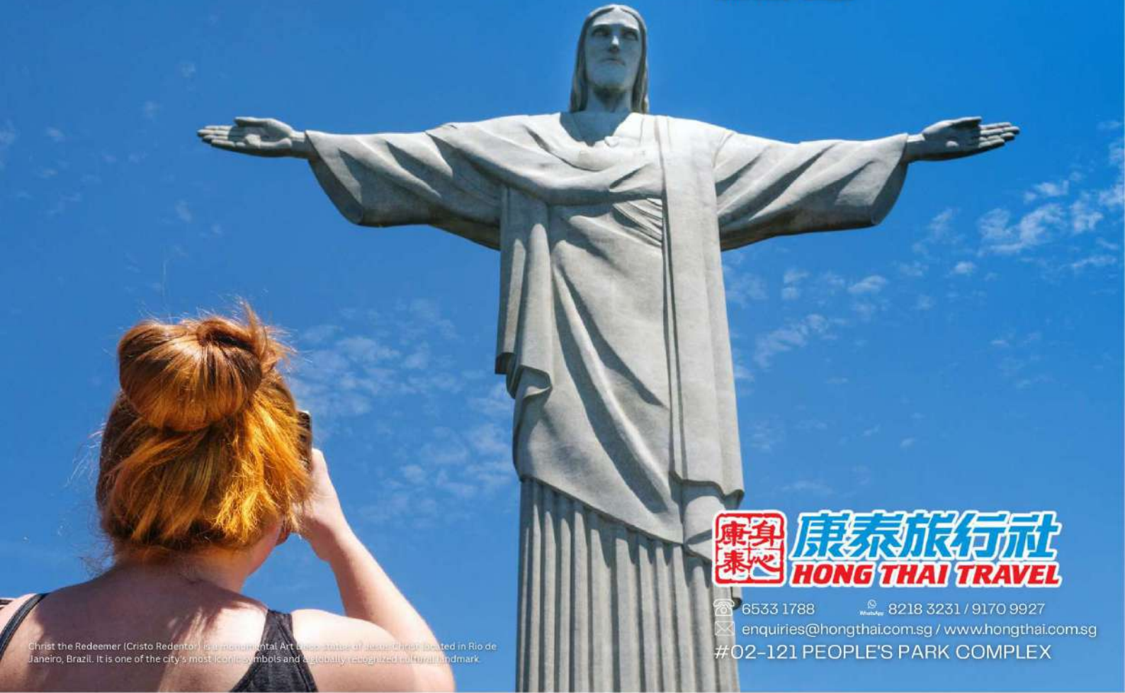
Christ the Redeemer (Cristo Redentor) is a monumental Art Deco statue of Jesus Christ located in Rio de Janeiro, Brazil. It is one of the city's most iconic symbols and a globally recognized cultural landmark.