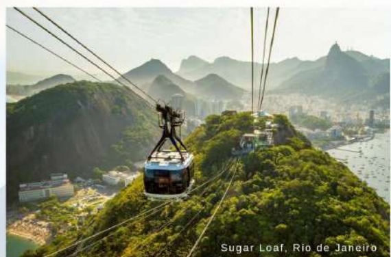
Sugar Loaf, Rio de Janeiro

*An entry fee of USD 100 per person is required for visiting Easter Island. **