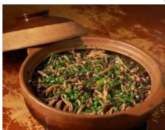
Taishan Yellow Eel Rice