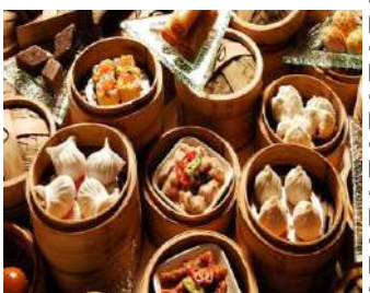
Canton Dim Sum