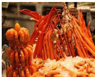
Hotel Buffet Dinner