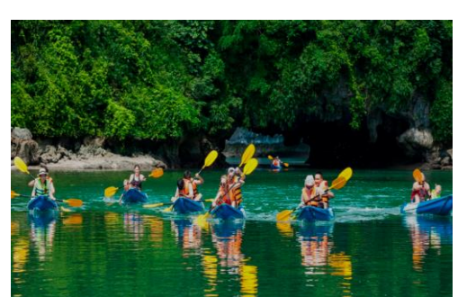
AN5HC BH 26APR24