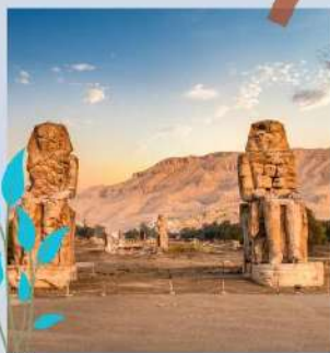
Colossi of Memnon