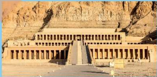
Mortuary Temple of Hatshepsut