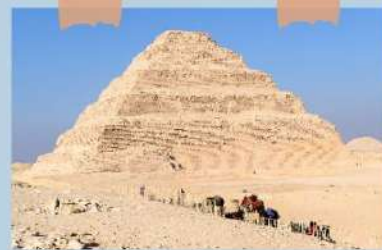
Step Pyramid of Djoser