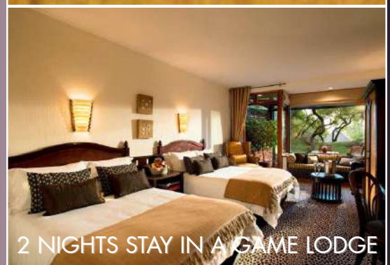
2 NIGHTS STAY IN A GAME LODGE