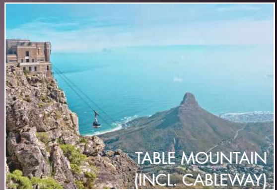
TABLE MOUNTAIN (INCL. CABLEWAY)