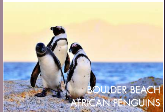
BOULDER BEACH AFRICAN PENGUINS