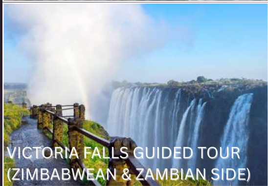
VICTORIA FALLS GUIDED TOUR (ZIMBABWEAN & ZAMBIAN SIDE)