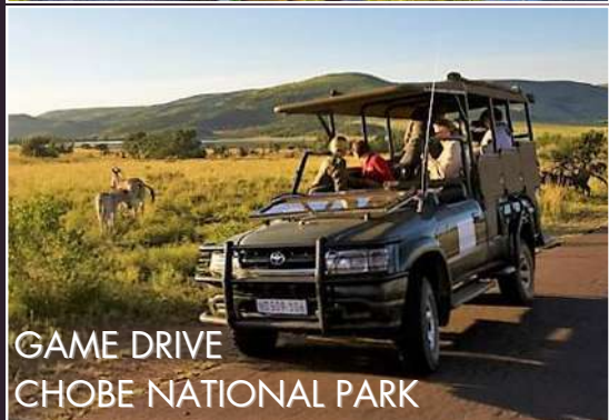
GAME DRIVE CHOBENATIONAL PARK