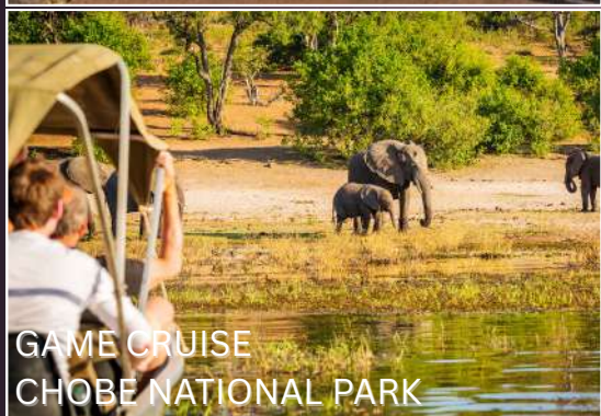
GAME CRUISE CHOBENATIONAL PARK