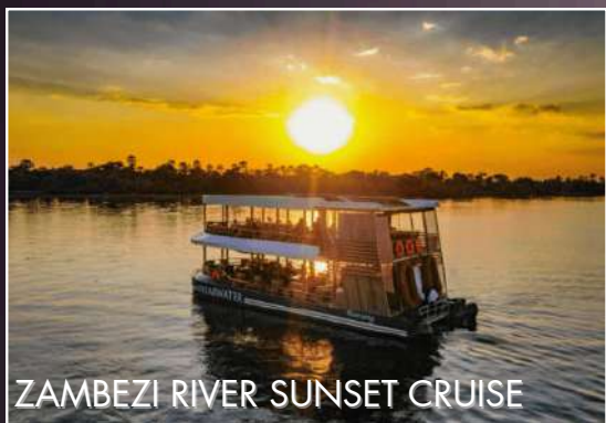
ZAMBEZI RIVER SUNSET CRUISE