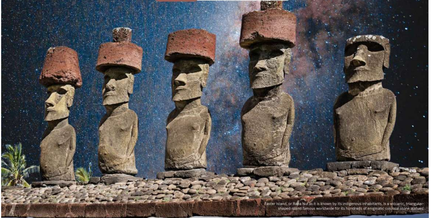
Easter Island, or Rapa Nui as it is known by its indigenous inhabitants, is a volcanic, triangular-shaped island famous worldwide for its hundreds of enigmatic colossal stone statues.