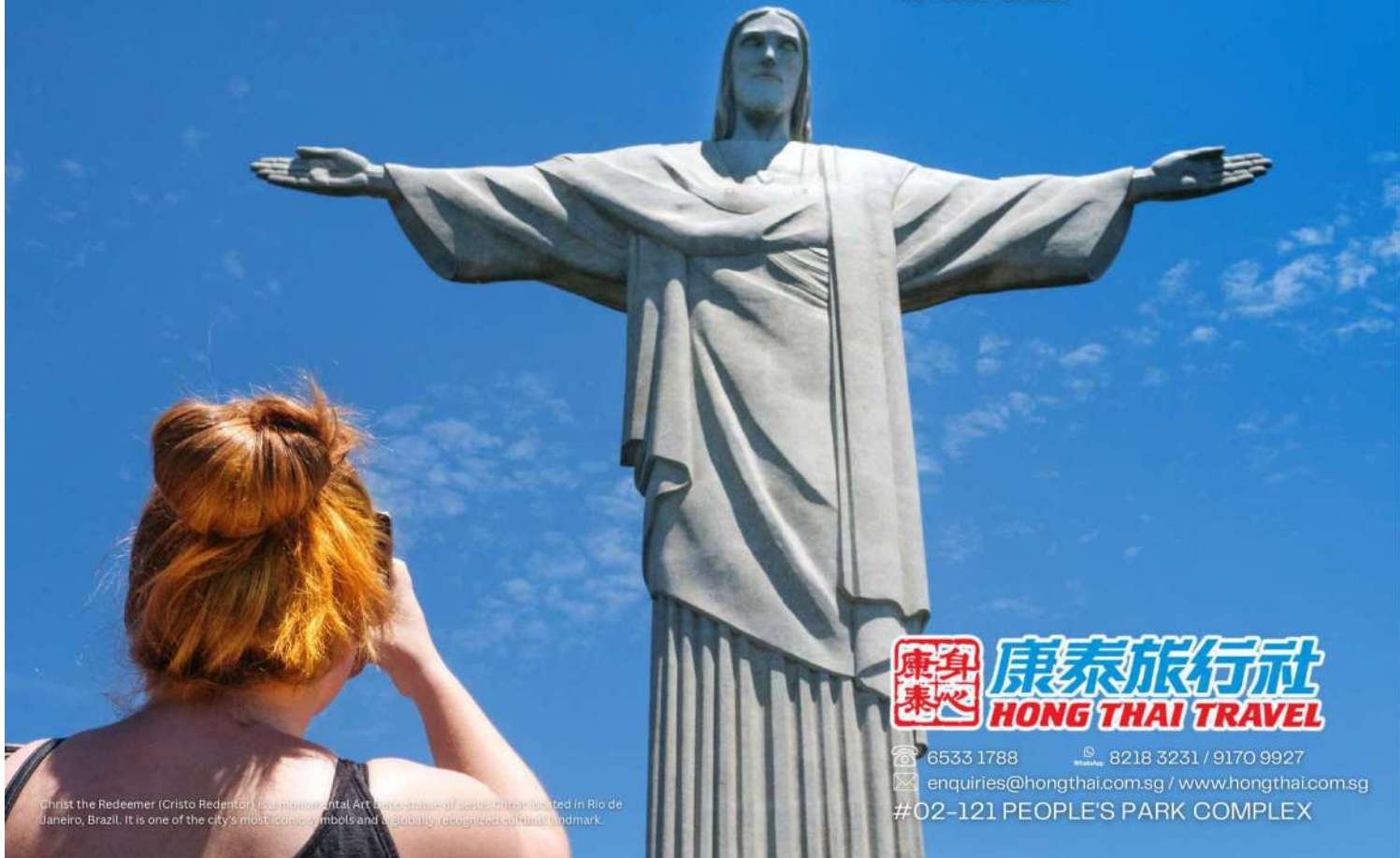
Christ the Redeemer (Cristo Redentor) is a monumental Art Deco statue of Jesus Christ located in Rio de Janeiro, Brazil. It is one of the city's most iconic symbols and a globally recognized cultural landmark.