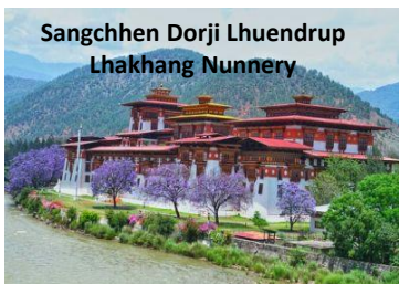
Sangchen Dorji Lhuendrup Lhakhang Nunnery