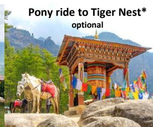
Pony ride to Tiger Nest* optional