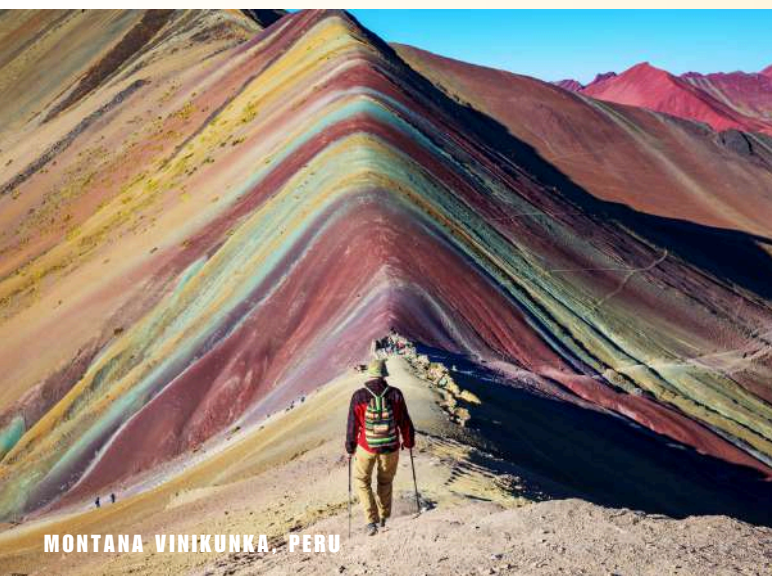
MONTANA VINICUNCA PERU