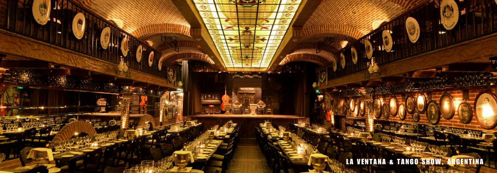
LA VENTANA & TANGO SHOW, ARGENTINA