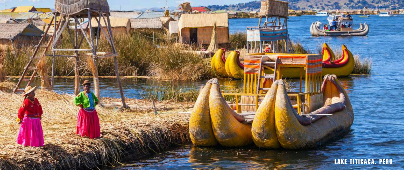
LAKE TITICACA, PERU