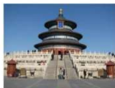
Temple of Heaven