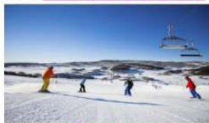
八達嶺滑雪場 ◀1/12 -次年15/02▶