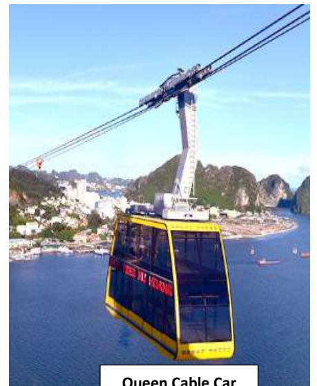
Queen Cable Car

Day 01: Singapore → Hanoi - the ancient capital city of Vietnam.