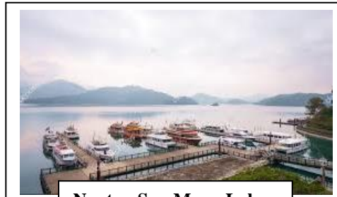
Nantou Sun Moon Lake