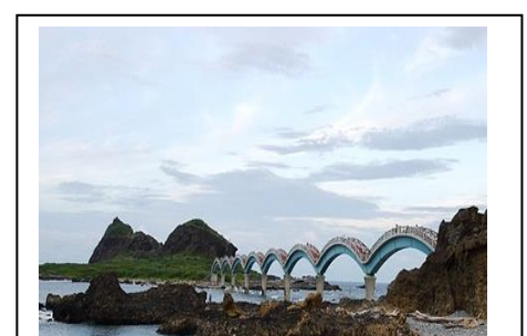
Three Fairy Platform