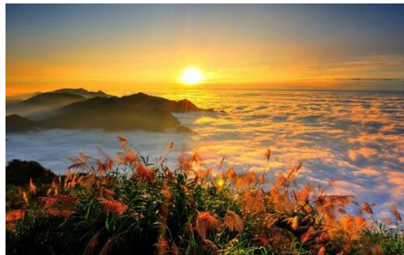
Alishan Zhushan Sunrise