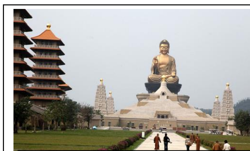
Kaohsiung FoGuangShan Buddha Memorial Center