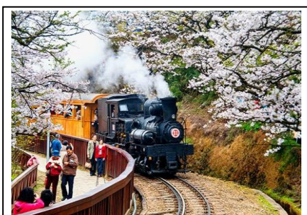
Alishan Forestation Recreation Area