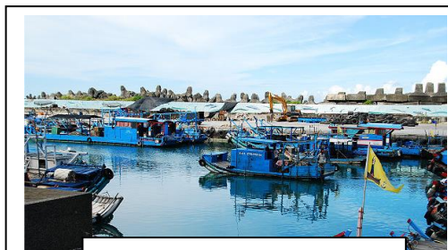
Shitiping Fishing Harbour

After breakfast, free at own leisure until meeting time for your flight back to Singapore with fond memories of a wonderful holiday with Hong Thai Travel!