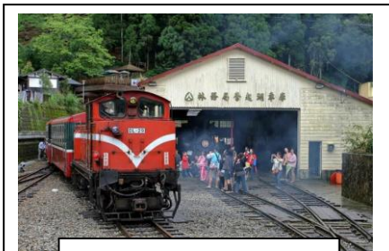
FenQiHu Train Station