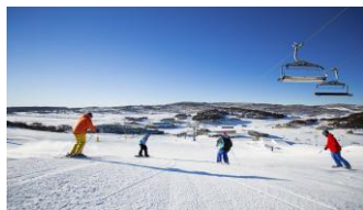
Badaling Sky Resort